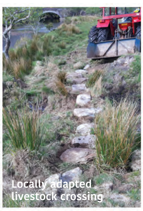
A sample of completed actions on participant farms. From left, peat plugs, timber weirs, and a locally adapted livestock crossing.